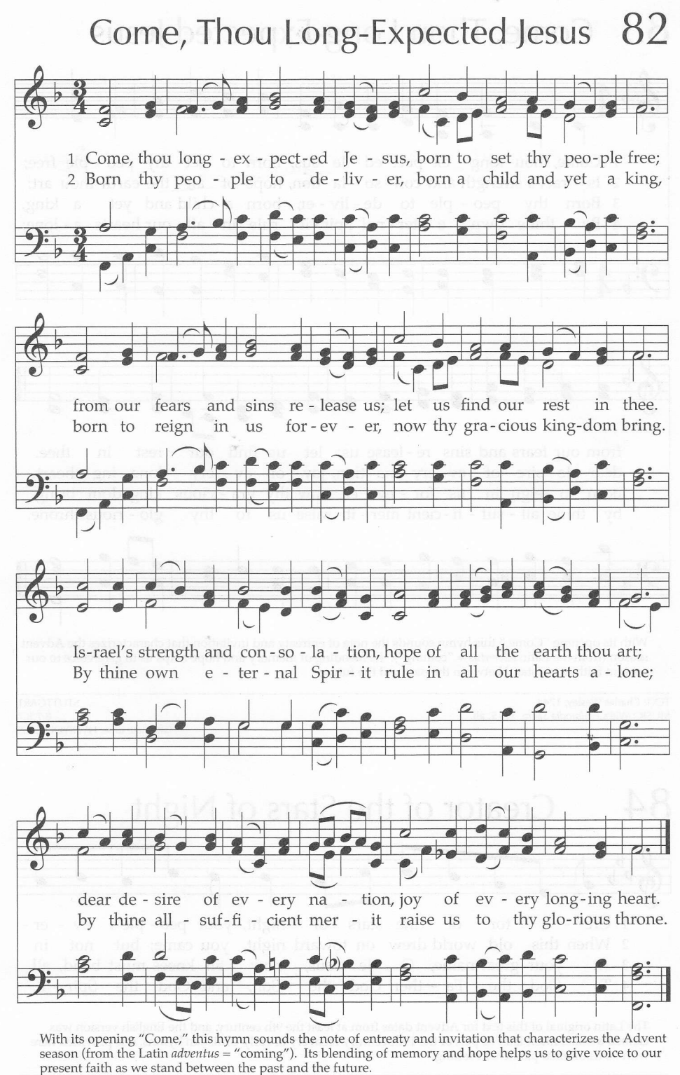
JESUS CHRIST: ADVENT