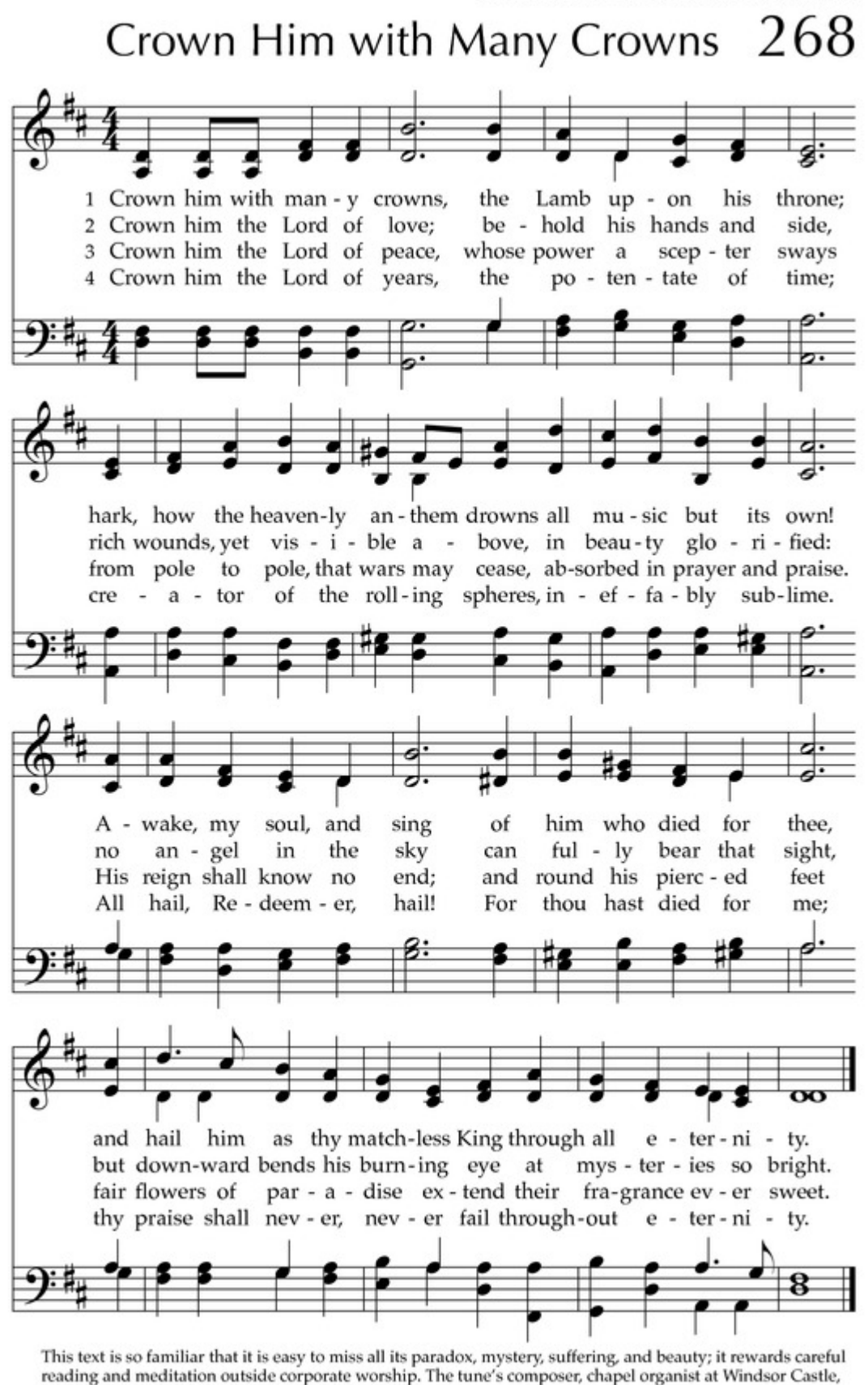
had much experience in creating a royal sound.