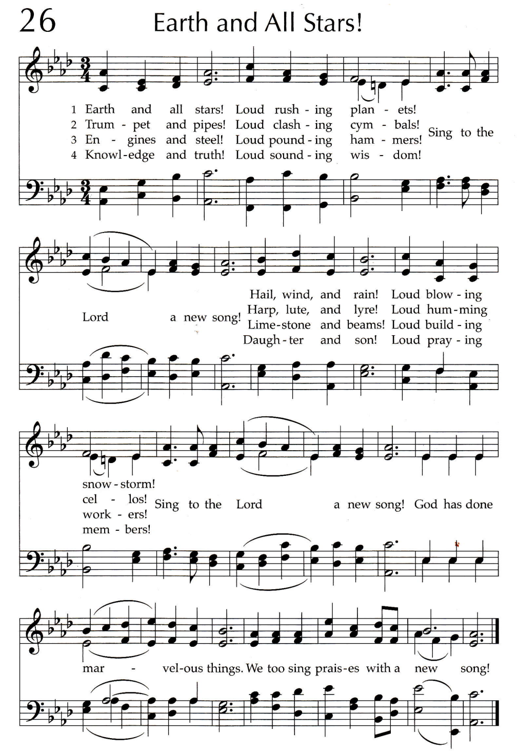
This lively text was written for the 90th anniversary of St. Olaf College in Northfield, Minnesota. Echoing Psalm 98, it is a prime example of a 20th-century hymn style based on phrases rather than complete sentences. The exuberant tune was created expressly for these words.