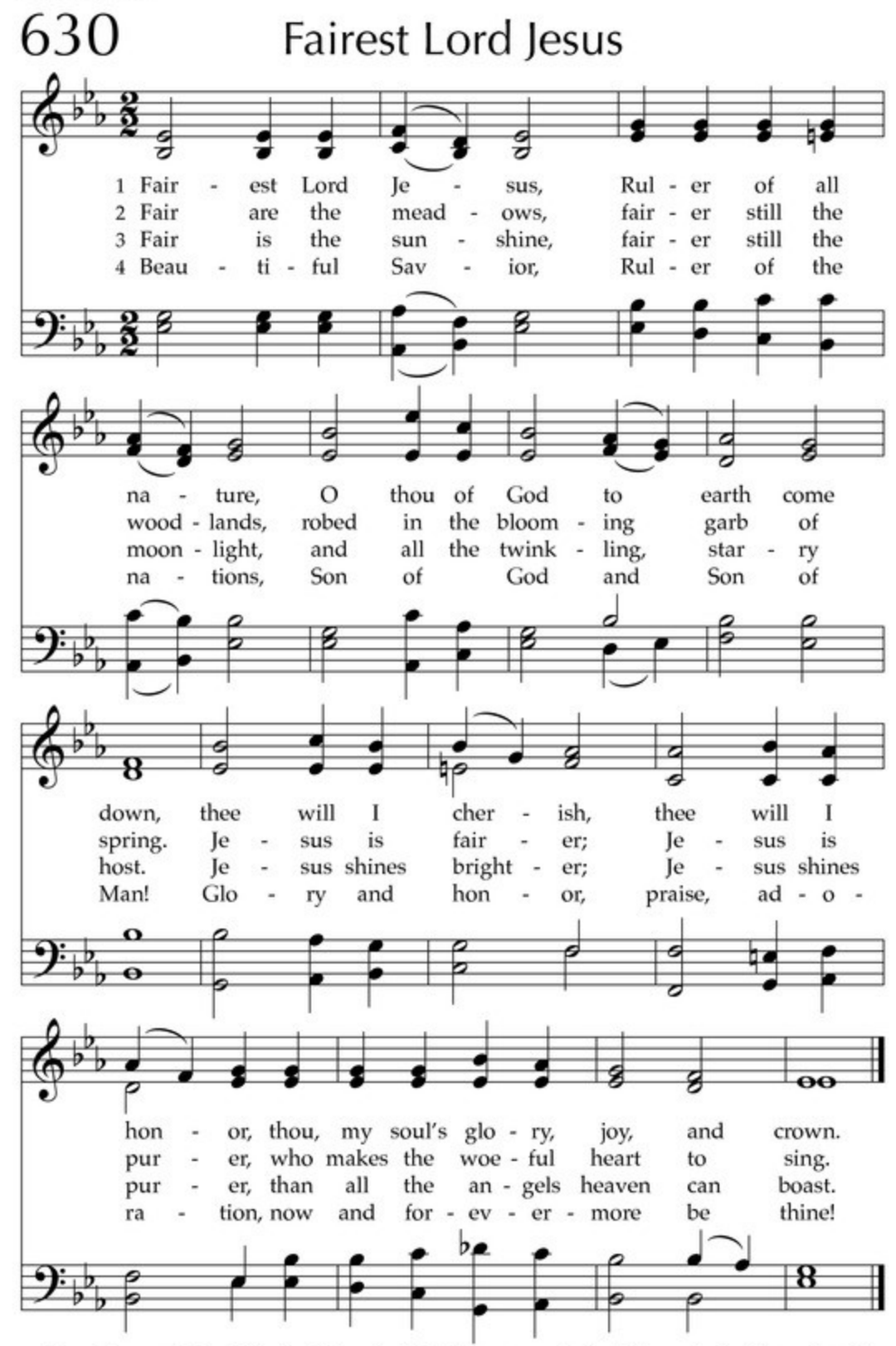
Franz Liszt used this melody for a "Crusaders' March" in an oratorio, but this hymn had nothing to do with the Crusades. No record of the German text exists before the middle of the 17th century or of the Silesian folk melody before the first half of the 19th century.