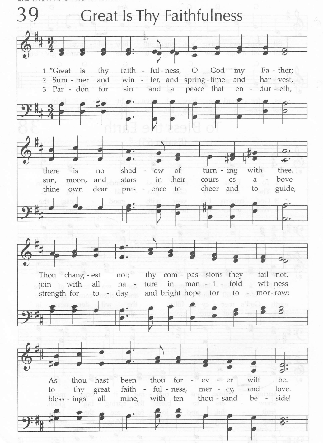
*Or "Great is thy faithfulness, O God, Creator."

Written as a meditation on Lamentations 3:22–23, this text is one of the few hymns among the 1200 poems by this Methodist writer and pastor that has gained much currency. The tune that appears here was composed especially for these words, and the pairing has proved enduring.