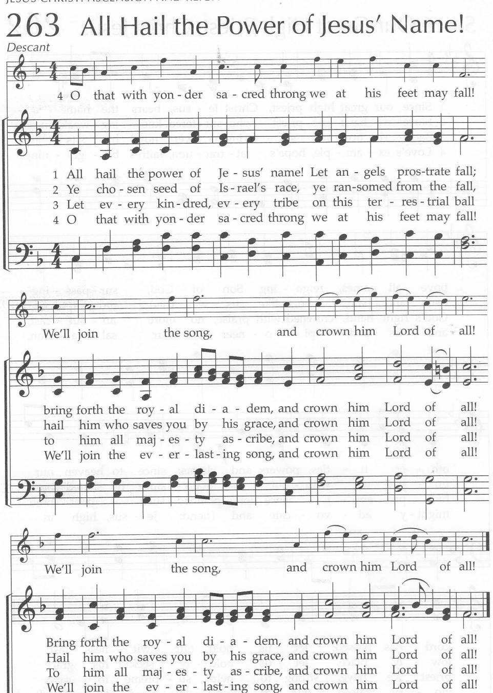
This 18th-century text celebrating the sovereignty of Christ has been through several expansions and contractions before reaching its present form. It is set here to the oldest American hymn tune in continuous use since first published in 1793, which was written for it.