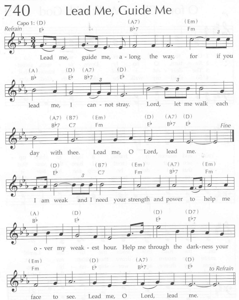
Guitar chords do not correspond with keyboard harmony.

This African American gospel hymn can well be understood as an updated adaptation of Psalm 5:8, with the "enemies" of the psalm treated as the pressures and temptations of daily life. As with the psalms, the "I" here is understood to express a shared communal experience.