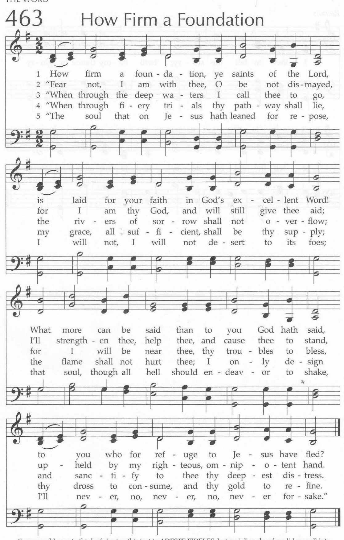
It seems odd now to think of singing this text to ADESTE FIDELES, but mainline churches did so well into the 20th century because of a cultural bias against shape note music. The vigor of the present tune seems especially right for the final line's reference to Hebrews 13:5.